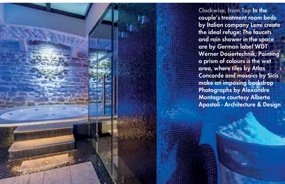
Clockwise, from Top In the couple's treatment room beds by Italian company Lemi create the ideal refuge; The faucets and rain shower in the space are by German label WDT Werner Dosiertechnik; Painting a prism of colours is the wet area, where tiles by Atlas Concorde and mosaics by Sicis make an imposing backdrop